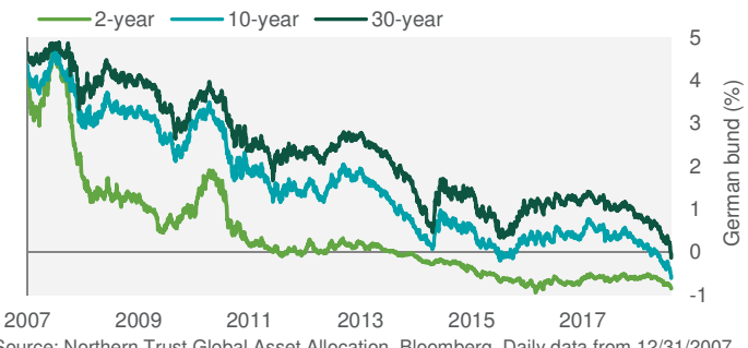
Daily data from 12/31/2007 to 8/7/2019.

German bund yields are now negative out to 30-year maturities.