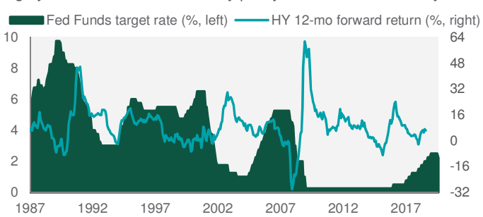
Fed Funds rate target bound is the upper bound. Data through 7/31/2019.

High yield benefits from monetary policy actions - but indirectly.