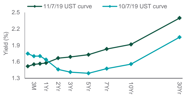
Source: Northern Trust Global Asset Allocation, Bloomberg. \mathsf{UST} = \mathsf{U.S.} Treasury.

Yield curve returns toward normalcy after rate cut.